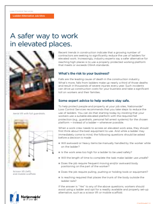
Ladder Alternative Job Sites Tech Sheet (CMO-0344AO)

Providing solutions to help our members manage risk. SM