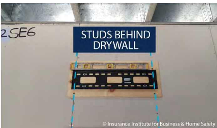
Figure 2. Flat screen mount bolted to retrofit board; retrofit board fastened to metal studs behind drywall.