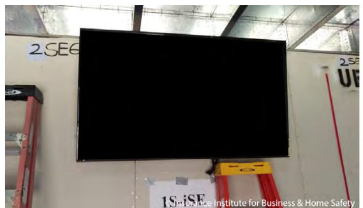
Figure 3. Completed flat screen installation.