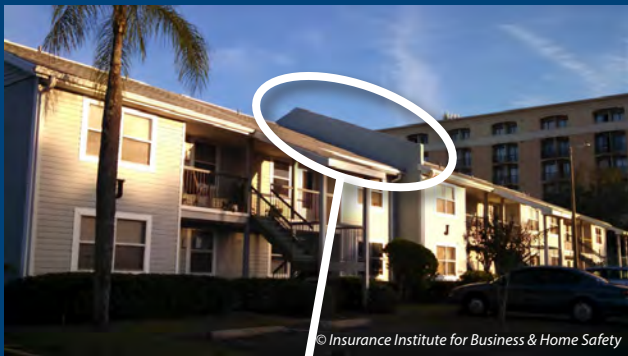
Fire wall separating two buildings – reducing the risk of a fire jumping from one roof to another

In order to prevent a fire from spreading through and above connecting units and buildings, a fire wall is constructed between units from the foundation to at least 30 inches above adjacent walls. These fire walls are typically two or three hour-rated in their protection, depending on the IBC Residential Group classification.