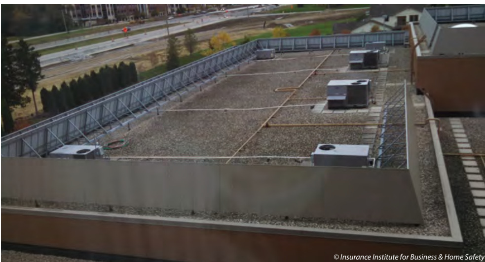
A wind screen on a low-sloped ballasted roof concealing rooftop equipment from the street and neighboring buildings.

1 Note: When used in Exposure D locations, IBHS recommends shingles pass both ASTM D3161 Class F and ASTM D7158 Class H testing standards.