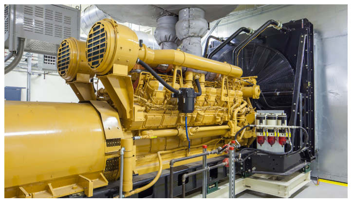
A permanent diesel generator , shown above, is a reliable backup option for larger businesses during a power outage.