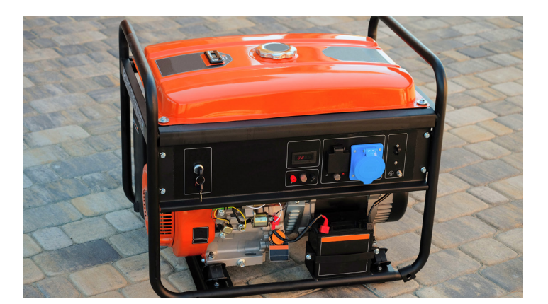
A portable gasoline generator , shown above, is a quick and easy backup option for small electrical needs.