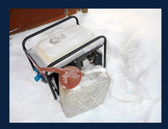
Snow accumulation on a generator, as shown above, can significantly impact performance during a snow storm.

Don't allow snow to accumulate on a generator if left out and running during a snow storm.