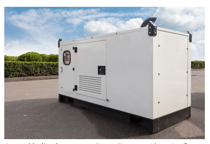
A portable diesel generator , shown above, provides a significant source of power and flexibility for a business in need.