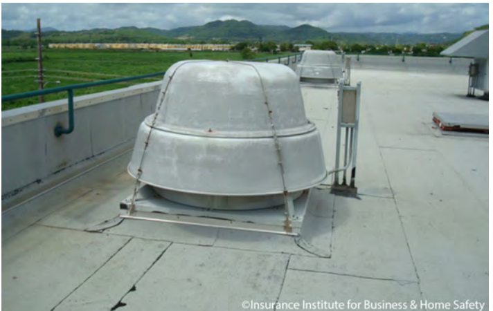
Is your business located in a high wind–prone area? Reinforce roof-mounted equipment with stainless steel cables and turnbuckles (shown above) to reduce risks.