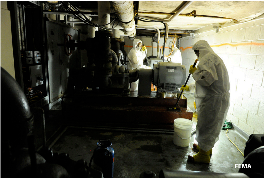
Workers clean utility equipment at Bellevue Hospital in New York City after Hurricane Sandy in 2012. Note the orange line painted on the wall showing the water depth.