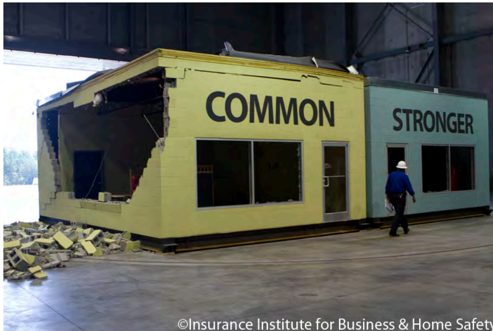
Figure 1. Masonry test specimens positioned side-by-side on the turntable in the IBHS Research Center. The “common” poorly reinforced building suffered significant structural damage, while the “stronger” building, which was reinforced using current NCMA code requirements, emerged from the test without even cracks developing, despite experiencing wind loads that were roughly 50% higher than those that caused the failure of the “common” building.